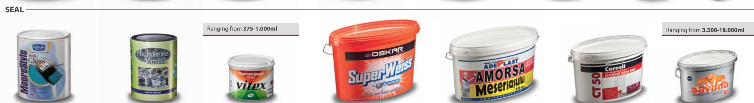
Ranging from 375-1.000ml