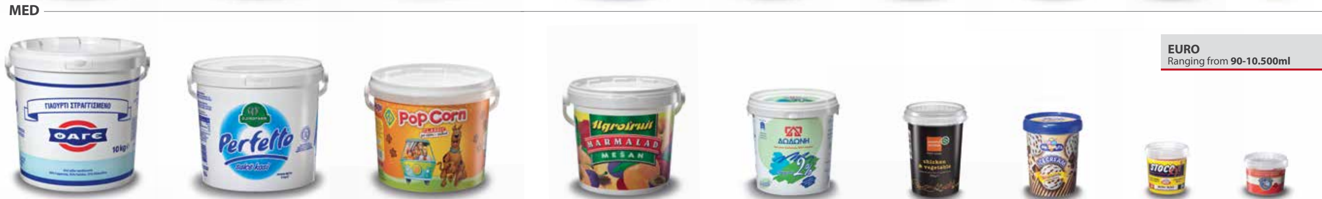
EURO Ranging from 90-10.500ml