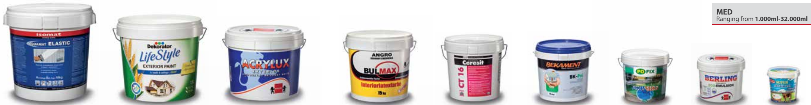
MED Ranging from 1.000ml-32.000ml

In Mould Labelling (IML), Offset Printing up to 6 colours, all our printing processes ensure optimal decoration results that will immediately draw the attention of your customers and establish a long-term relationship with them.